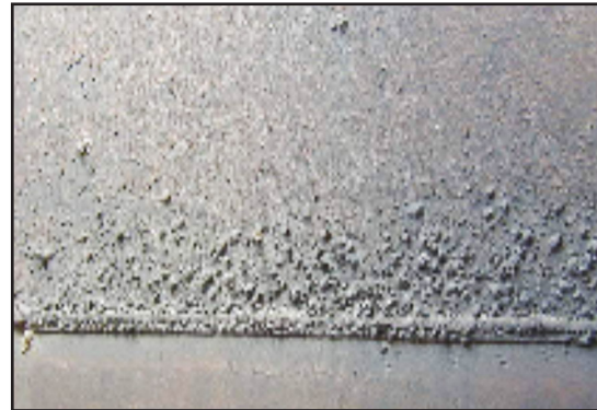
Blistering of the existing urethane liner