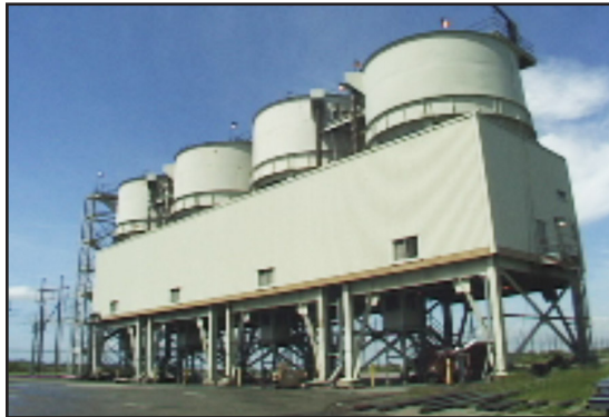
Ash dewatering bins

Failure of a PU liner in 2 years resulted in pitting and corrosion, which increased friction and caused sludge hang up in bottom ash dewatering bins.